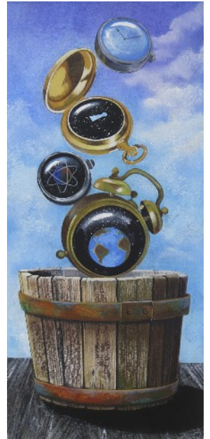
Jan Lucking, "The Bucket of Proof"

QUALIFYING MEDIUM includes oil, watercolor, acrylic, encaustic, pastel, or any combination thereof. If two or more mediums are used in creating the artwork, it is considered mixed media and a statement of content, process, technique and execution must be provided. EXCLUDED from this painting competition are the following: drawings, photography, digitally or computer-enhanced work, hand-pulled prints, giclées and reproduction prints.