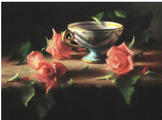
Tracy Wilson, "Demitasse With Roses"

ENTRY FEES for 1 or 2 images $35, 3 images $45, 4 images $55. If you are entering only one image, the image must be duplicated for second image. Entry fees are non-refundable. Entry fees may be made online through the CaFÉ™ website with credit card or PayPal, or you may pay via check or money order to Emerald Art Center.